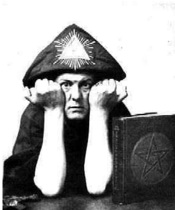
World renowned Satanist, Aleister Crowley , wearing the all-seeing eye cap (notice the pyramid!)