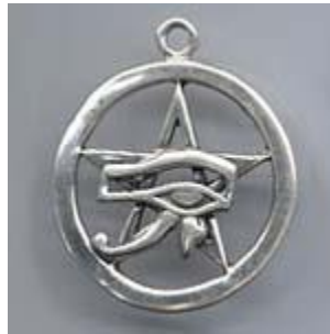
Wiccan "all seeing eye" pentacle charm, sold throughout the Internet

WARNING: Do NOT be taken in by the warm and fuzzy exterior of this cult, Mormons are NOT Christians. And when they say the name Jesus, it is NOT the Jesus of the Bible! Jesus said, "Ye must be born again!" -John 3:3.